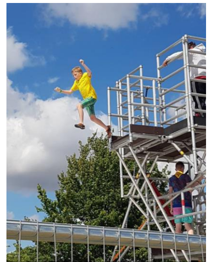
This is one small step for...aaaargh!

The Essex International Jamboree in August was a truly amazing camp! They may have only been 10 miles from Brentwood but the 10 members of 3rd Brentwood Scouts and the Skips had a fantastic time as part of the Brentwood District contingent. There was good food, fine weather and an incredible variety of activities including a few surprises such as clay pigeon shooting, parkour (look it up! It is great fun!), the "Leap of faith" and live entertainment on a festival scale! Couple all of this with the opportunity to live for a week alongside several thousand Scouts and Guides from all over the World and you'll start to see why anyone that you speak to