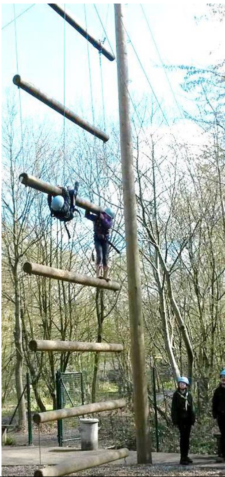
No idea what this is called but it looks rather scary and very hard!

*Note from the Editor: I should imagine they needed it after all that activity!