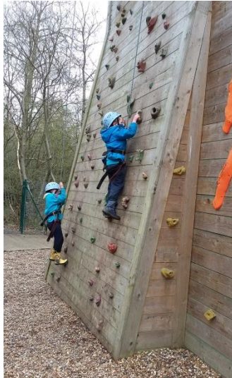
Gravity defying Beavers!

Prior to the summer break, an early Easter resulted in a longer summer term with lots of good weather and sunny evenings to enjoy being outdoors at every opportunity. Eight Beavers joined the District Camp at Thriftwood for the day on April 15th where they explored, visited the Tented Village to see inside the tents where our Cubs and Scouts were sleeping, and took part in a variety of activities including racing pedal cars and scaling and descending then climbing and abseil wall.