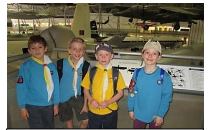
A fantastic day out at Duxford

In June, the Assistant District Commissioner for Beavers organised a trip to the Imperial War Museum at Duxford where four 3BW Beavers joined a coach full of very excited children. It was a beautiful sunny day and they were lucky to see lots of planes taking off and landing while they ate their picnic.