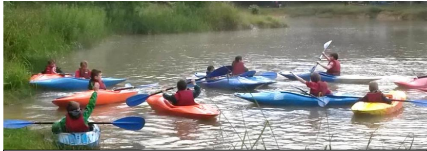
Great Britain's 2028 Olympic synchronized kayaking team at an early training session

There was certainly kayaking, climbing, abseiling, laser tag, den building, fire lighting (under close supervision, obviously!), and go-karting, and that was just at Thriftwood! For some of the cubs it was their first time doing many of these activities and, despite the occasional wobble (quite literally in the case of the kayaking), it never ceases to surprise how daring the cubs can be!