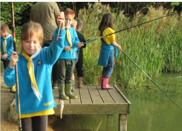
A meal fit for a Beaver!

In July, the Beavers were guests at the Brentwood Theatre for a backstage tour. Mark and David from the theatre showed them how everything is organised to put on a show and the Beavers had the chance to play with lots of different coloured spotlights and used the sound system to create background noises including birdsong, a storm and trains. July also saw a few "goodbyes" including to one of the leaders, Eagle, who is moving away and two Beavers who have moved up to cubs! A lot of Beavers were also presented with badges they had worked hard to achieve and we were proud to see one Beaver presented with his Chief Scout's Bronze Award. Phew! What a busy bunch!