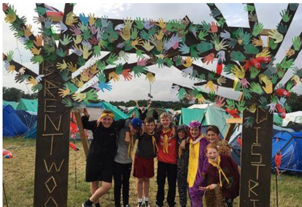
Award Winnina Gate!

As if all that wasn't enough, the good weather meant there was also ample opportunity to canoe, climb and abseil at Thriftwood and invite parents along to experience an evening at Scouts...with the young leaders helping out the Skips by organising and running their own versions of classic wide games, it would seem that everyone went home having had a fun evening.